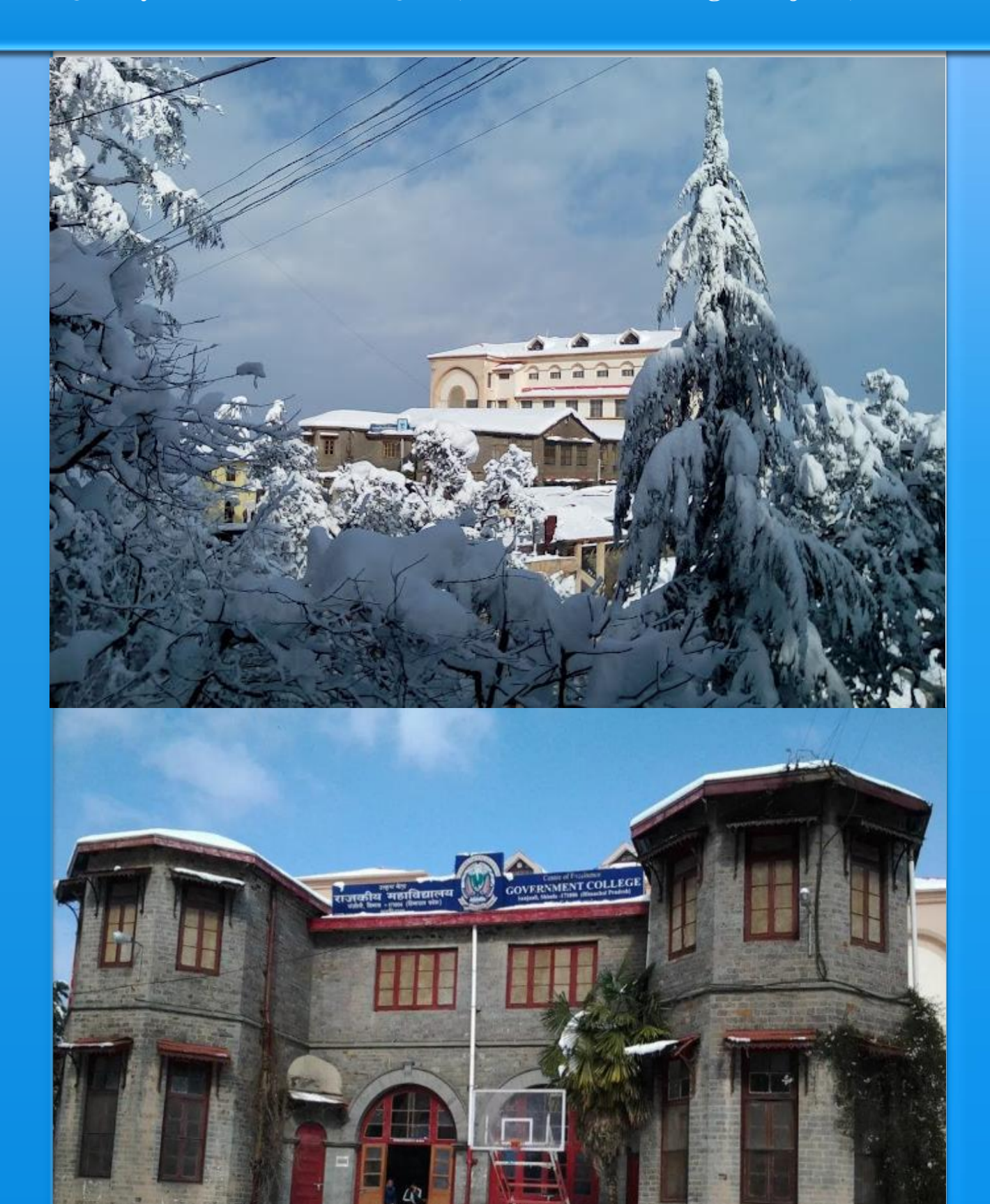
Prepared By: Internal Quality Assurance Cell (IQAC), Government College Sanjauli, Shimla-6.