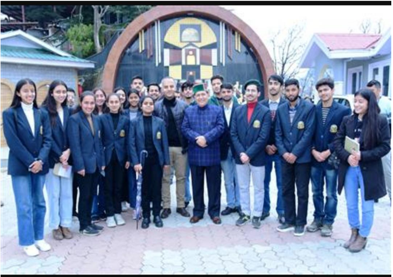
Photograph with the Honourable Speaker of Himachal Pradesh Vidhansabha