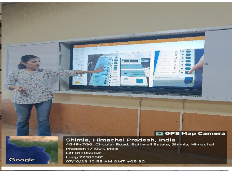
GPS Map Camera Shimla, Himachal Pradesh, India 454P+7G6, Circular Road, Bothwell Estate, Shimla, Himachal Pradesh 171001, India Lat 31.105964° Long 77.18536° 07/10/23 10:58 AM GMT +05:30