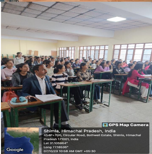
GPS Map Camera Shimla, Himachal Pradesh, India 454P+7G6, Circular Road, Bothwell Estate, Shimla, Himachal Pradesh 171001, India Lat 31.105964° Long 77.18536° 07/10/23 10:58 AM GMT +05:30