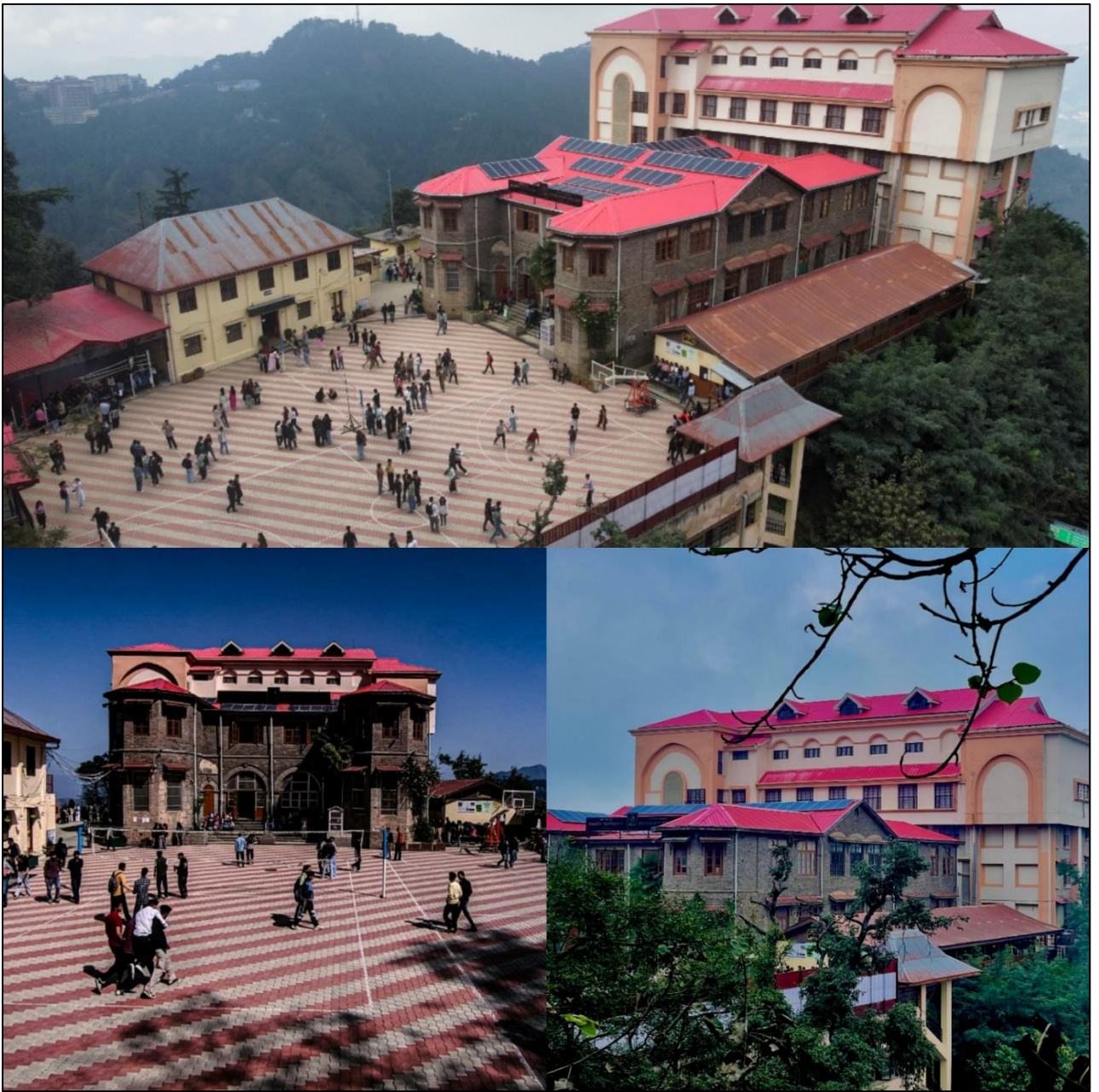
Photographs by students: