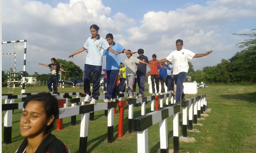
GUARD OF HONOUR TO ADG DTE