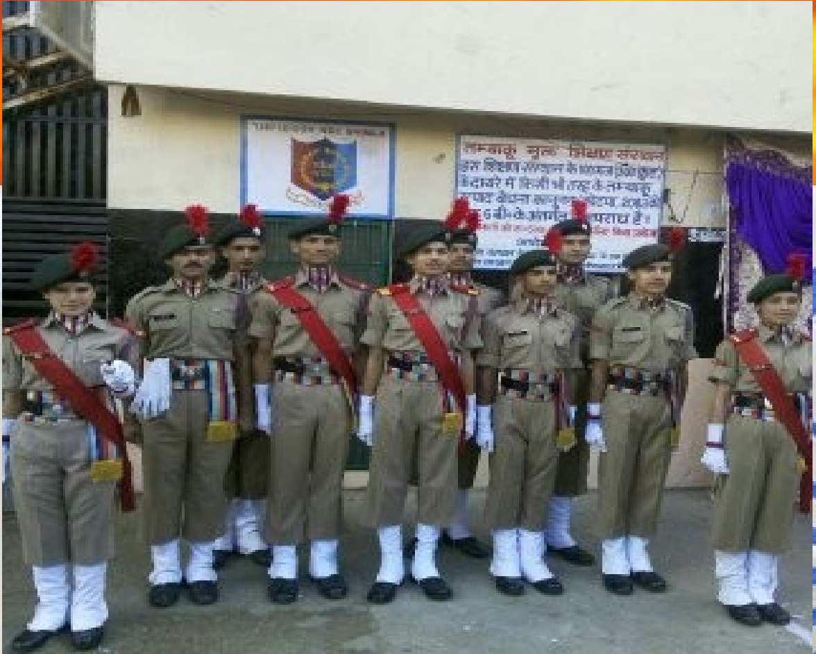
Camp :RDC (REPUBLIC DAY PARADE)