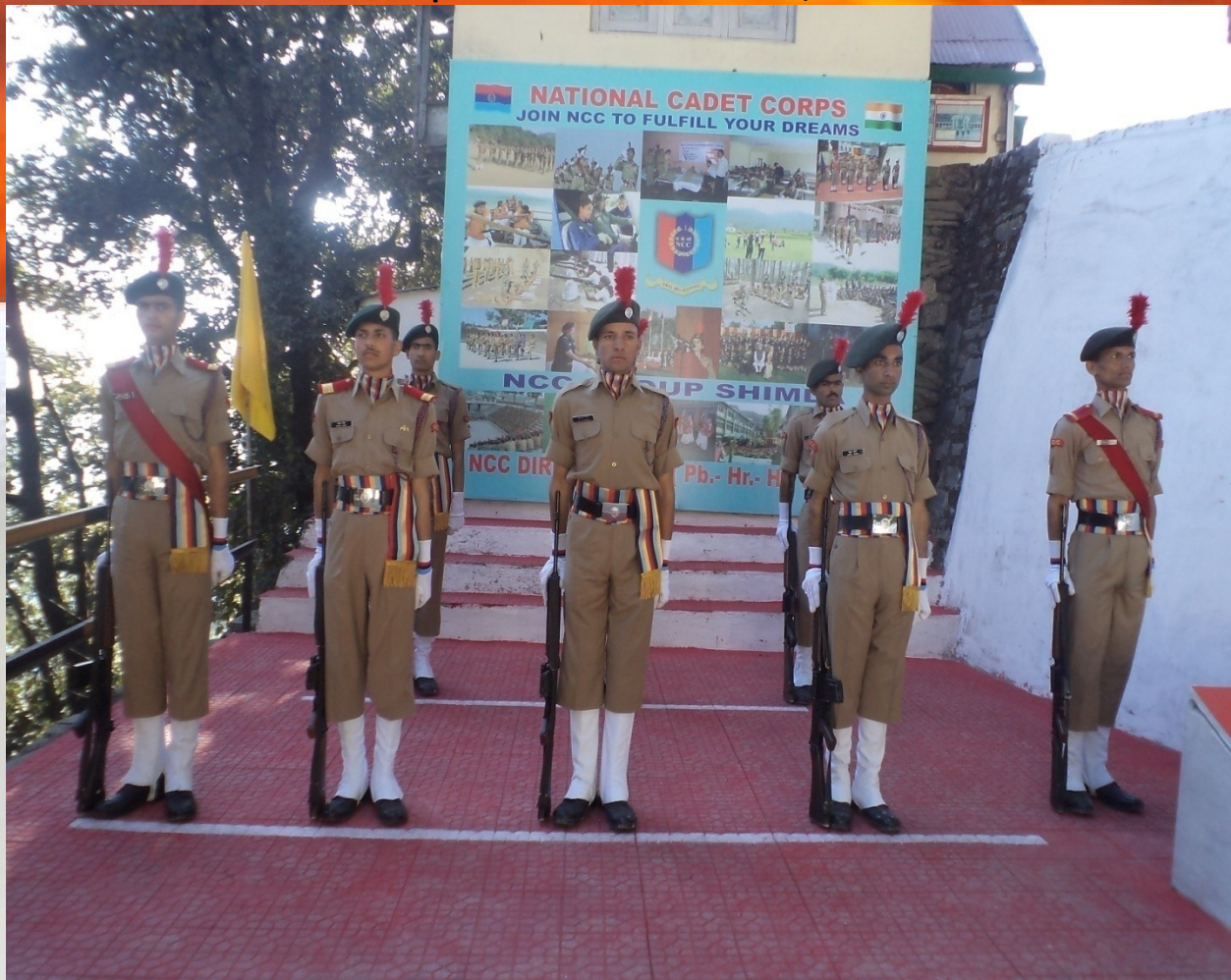
Camp : HIMACHAL DIWAS PARADE

Date : 15 th April, 2014 Venue : Ridge Maidan Shimla Participation : 09SD + 05SW Achievement :-