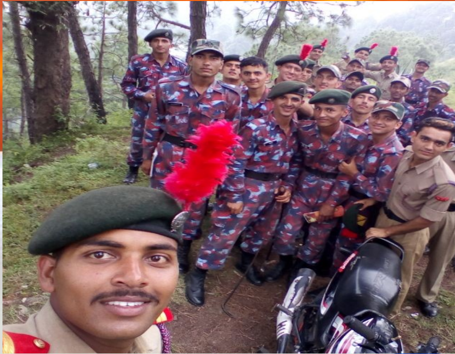
Camp : CATC-200 (COMBINED ANNUAL TRAINING CAMP)

Date : 05 th Sept, 2016- 14 th Sept, 2016