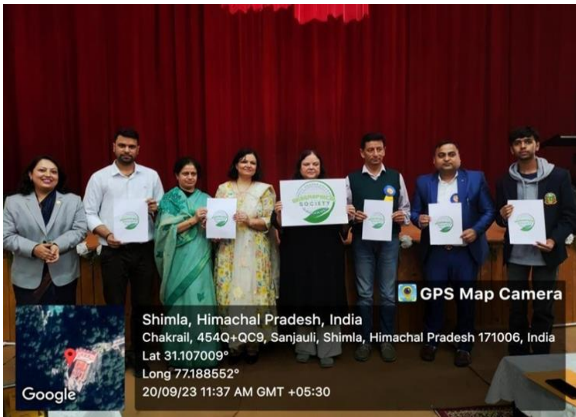
LAUNCHING OF LOGO OF GEOGRAPHICAL SOCIETY