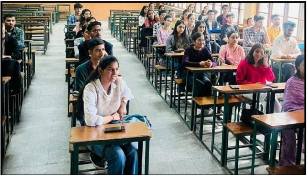
FTC members attending the meeting.