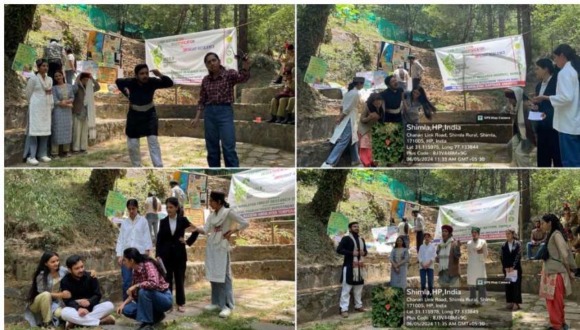
College Skit team

The college skit competition team really stole the show with their innovative takes on environmental issues. "Industrialisation, deforestation and their impacts on society and other organisms" was one of the serious topics covered in the skits, which also offered solutions and inspiring messages. The audience loved the performances and thought. Students did a great job using theatre to convey meaningful ideas.